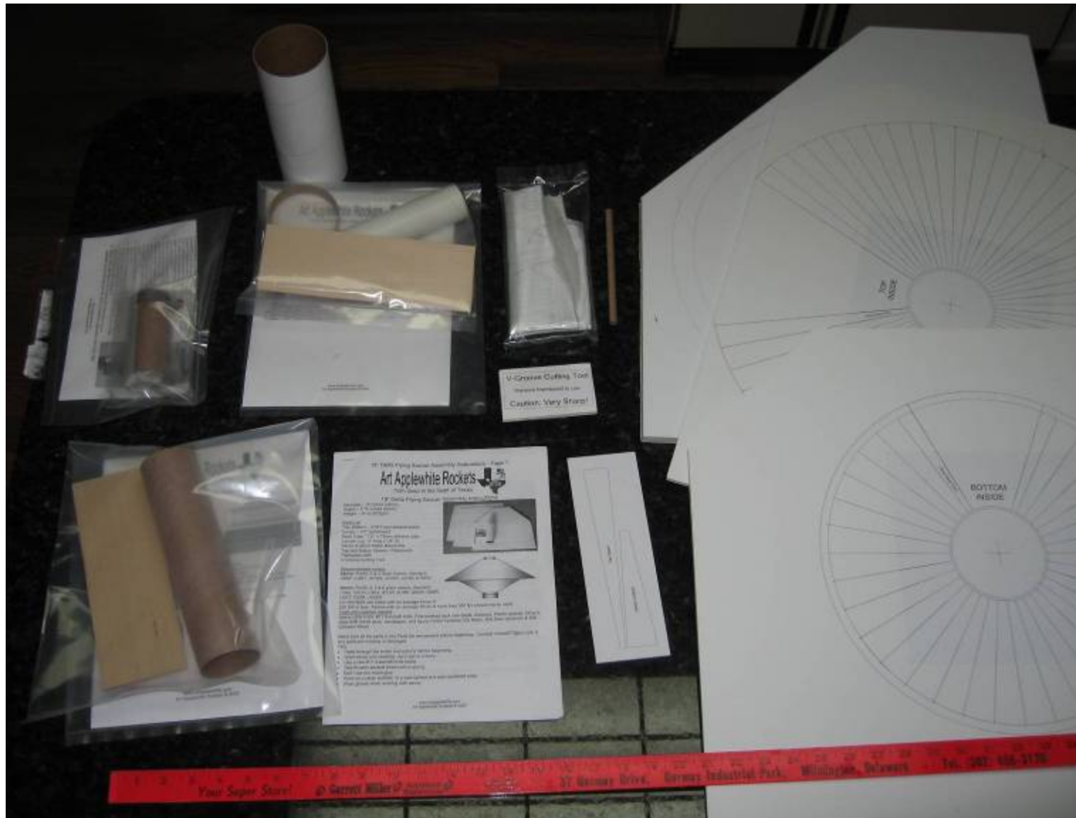
The Art Applewhite 18" saucer kit, What you get for your money, along with a lot of packing peanuts!